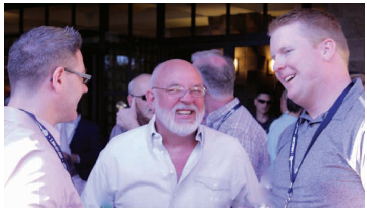
"Hey, man, this warm weather is great!"