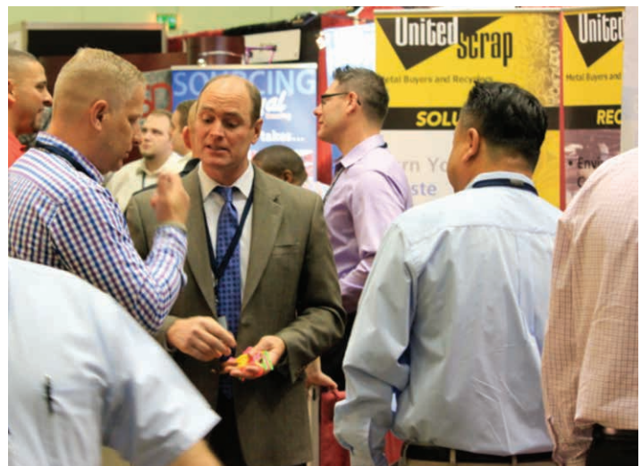
The Investment Recovery Trade Show is always a jam-packed affair. This year, 60 specialty contractors and suppliers shared their stories with their fellow IR professionals.

For lots more photos, go to InvRecovery.org and click on the 80th Seminar & Trade Show link on the left.