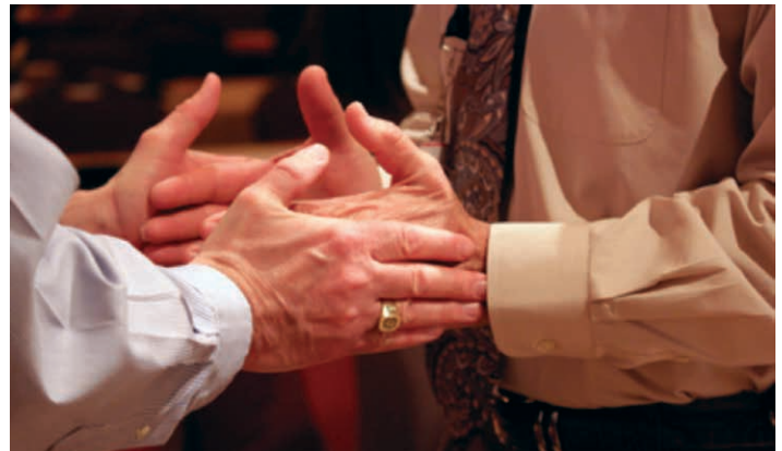
"If you relax, this is much easier!"