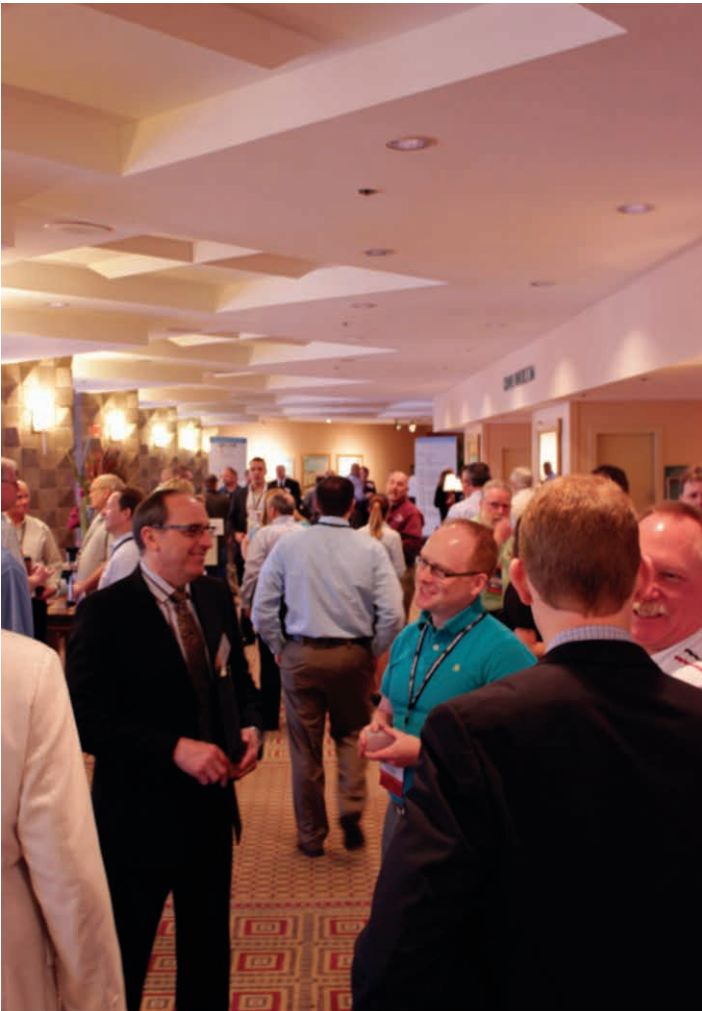
"It may technically be a 'break,' but this is where I make some of my best connections."