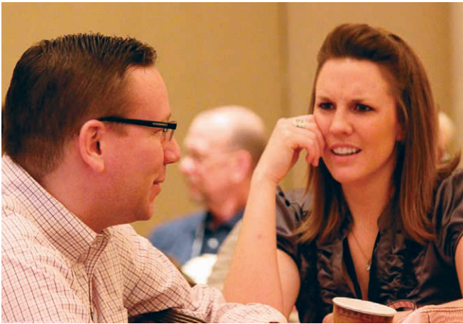
"Wow, Andy! That's fascinating!"